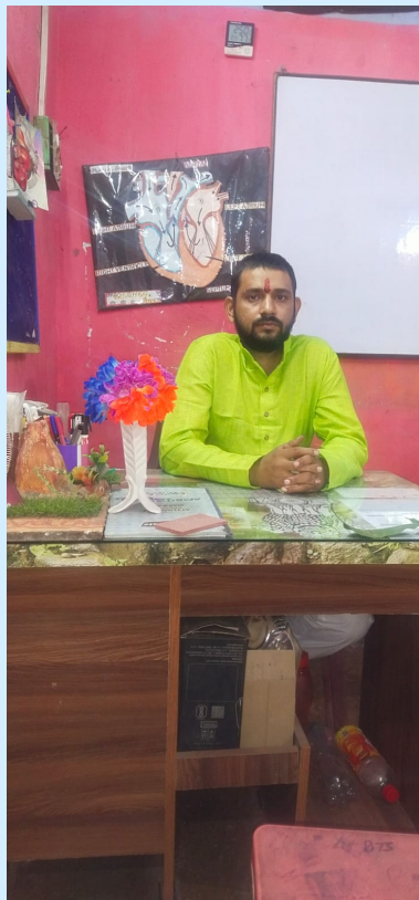
Office Pic Inner